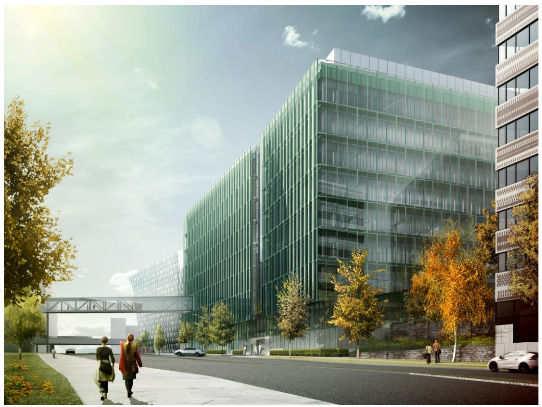
Illustration Architect: CF Møller