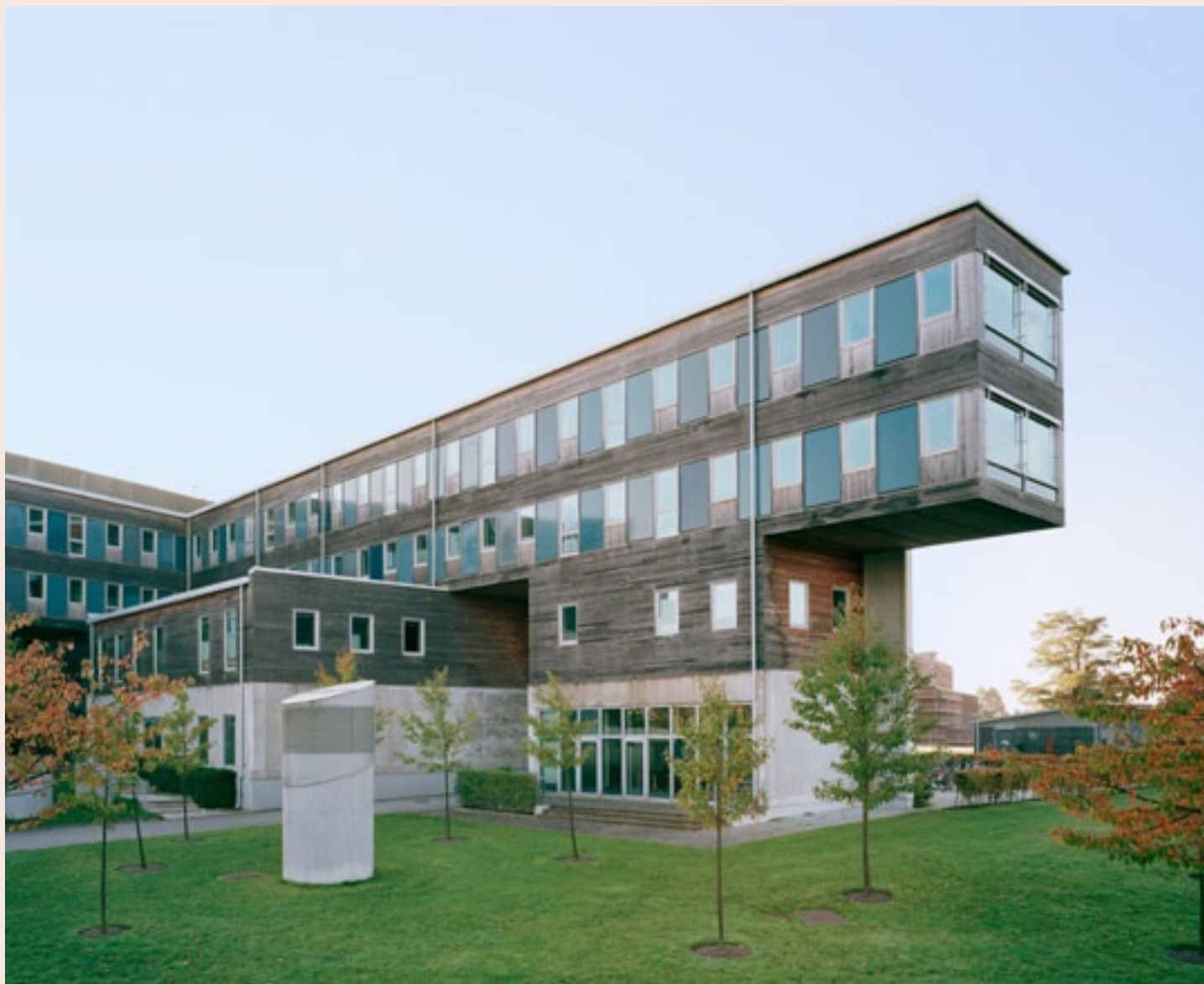
Ingvar Kamprad Design Centre, Lund University